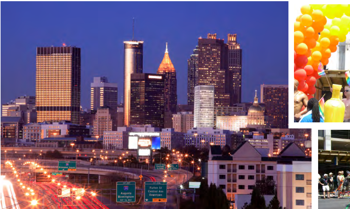
Atlanta is a hub of industry and media. Coca-Cola, The Weather Channel, CNN News, Delta Airlines and Home Depot are just some of the major companies that count Atlanta as their HQ. Atlanta Pride is one of the oldest in the nation - starting in 1971.

ACPA STANDING COMMUTTEE POF Lesbian, Gay Bisexual and Transgender Awareness