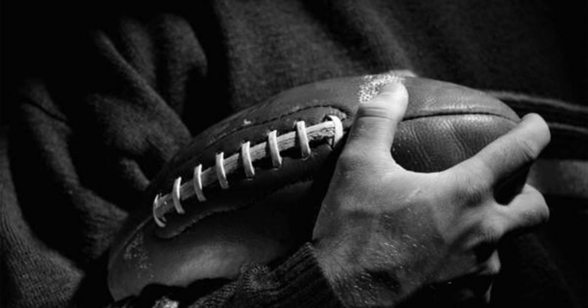
Image of the Sexual Animal